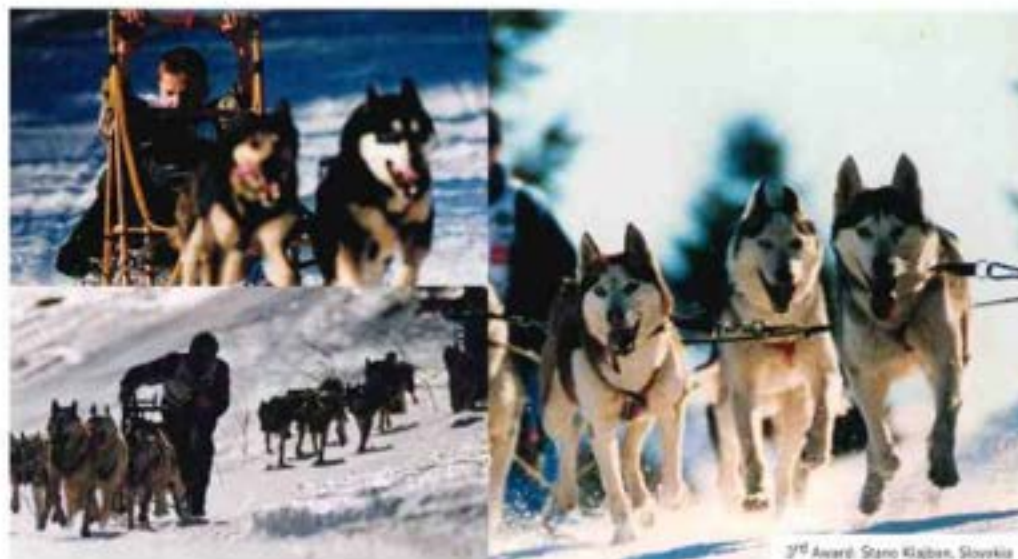
3 rd Award: Stano Klajban, Slovakia