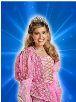
Aurora The Princess