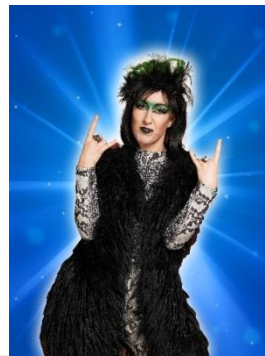
Rubella (Magnificent's Daughter)